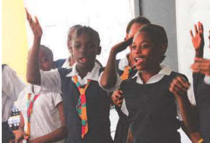
Left to right: Neighborhood kids helped to repaint the gates of the house for the staff of the More Than Me Academy in Liberia. In addition to educating children, the academy was designed to offer an even rarer commodity: hope. In February 2014 students played in the academy's courtyard and sang in a classroom.

ing from the program, the clinicians fanned out across the country to deliver basic mental health services such as psychotherapy, counseling for addiction and support for PTSD. By spring 2013, when the fourth class graduated, all 15 counties in Liberia had access to at least one locally trained and credentialed mental health clinician.