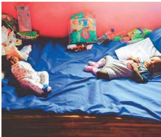
In Liberia, the Ebola epidemic has left many children without families to care for them. These babies were abandoned by Ebola-stricken family members. Only one of them ( right ) survived. That child was reunited with her mother in an Ebola treatment unit.