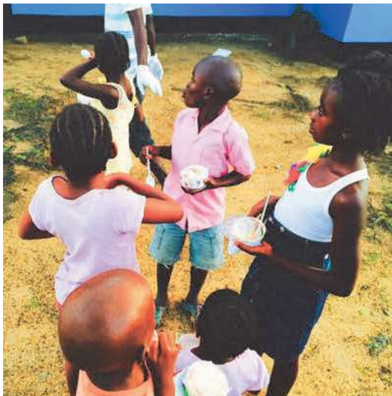
The parents of these six siblings ( far left ) died from Ebola. More Than Me supplied the children with clothes and food at an interim child care center, where they were living. Ice cream for the orphans ( left ) helps to lift their spirits.

tion Hospital. She helped to transform the More Than Me school building into a warehouse for food and medical supplies and a training facility for the coalition of volunteers working to stamp out Ebola in the slum.